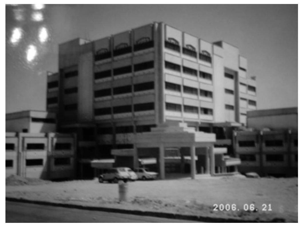
Isfahan University Library Building

and equipments some spaces of the library building have fallen short of the immediate needs. Since the library has not been shifted to the new building completely (till the time of visit by the investigator of the present study), the explanation of the space, meant for various sections of the library is not possible at this stage.